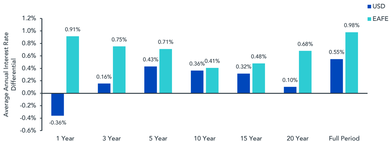
Positive values indicate a "Net Benefit" while negative values indicate a "Net Cost" via interest rate differentials.

The WisdomTree U.S. Quality Dividend Growth Index ETF seeks to track, to the extent possible, the price and yield performance of the WisdomTree U.S. Quality Dividend Growth Index CAD , before fees and expenses. The fund has issued non-hedged units ( TSX: DGR.B ) and 100% passively hedged units ( TSX: DGR ) so that investors are empowered to take control of their international currency exposure. For those investors with concerns about their ability to decide how to rotate between hedged and unhedged strategies, Variably Hedged™ units of the WisdomTree U.S. Quality Dividend Growth Variably Hedged Index ETF™ (TSX: DQD) are available. For more information on our Variably Hedged™ currency strategy, see our International Investing brochure on our website.